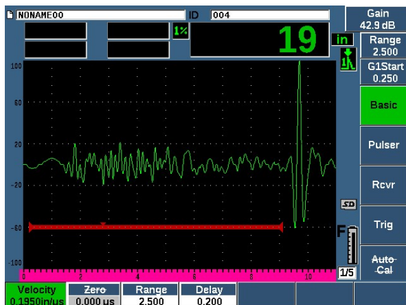
Figure 3. Good area of casting.