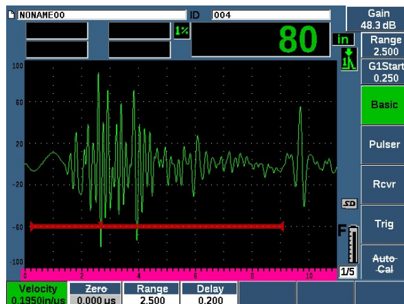
Figure 4. Porosity indication.

While the most common flaw detection application in castings involves voids, porosity, and inclusions, some users also need to check for cracks or fractures. Crack tests must always be developed with respect to the specific geometry of the casting, as well as the location, size, and orientation of suspected cracks. Also, crack tests must use appropriate reference standards containing known or artificially induced defects. Straight beam transducers are used when the crack face is parallel to the transducer coupling surface. Angle beams are used when the crack is perpendicular or tilted with respect to the coupling surface. Note that due to the lower sound velocity in cast iron and nonferrous castings, the actual refracted angles of wedges designed for use on steel will be lower. These angles should be recalculated by means of Snell's law whenever conventional steel wedges are used on other materials.